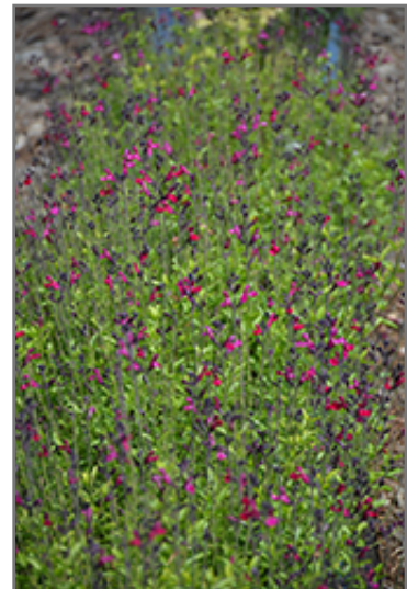
Vibe Ignition Fuchsia Sage in bloom