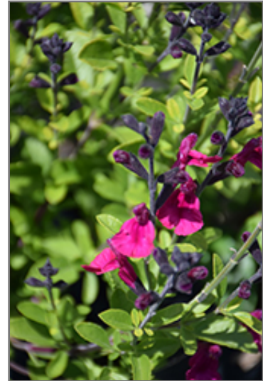
Vibe Ignition Fuchsia Sage flowers

Vibe Ignition Fuchsia Sage is a fine choice for the garden, but it is also a good selection for planting in outdoor pots and containers. With its upright habit of growth, it is best suited for use as a 'thriller' in the 'spiller-thriller-filler' container combination; plant it near the center of the pot, surrounded by smaller plants and those that spill over the edges. Note that when growing plants in outdoor containers and baskets, they may require more frequent waterings than they would in the yard or garden.