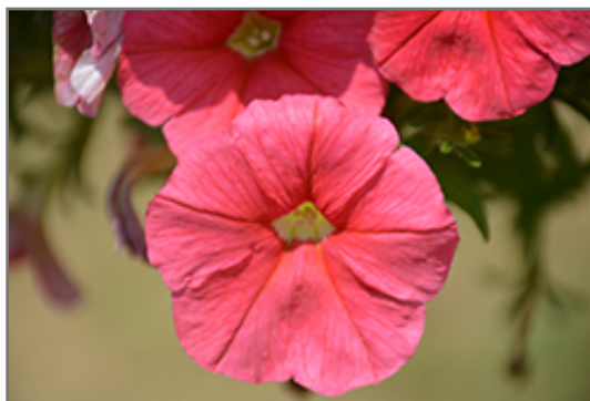
Sanguna Patio Salmon Petunia flowers

Sanguna Patio Salmon Petunia is recommended for the following landscape applications;