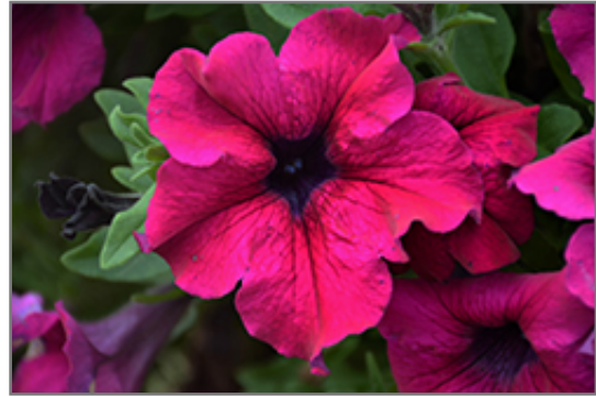
Sanguna Mega Purple Petunia flowers

This plant will require occasional maintenance and upkeep. Trim off the flower heads after they fade and die to encourage more blooms late into the season. It is a good choice for attracting butterflies and hummingbirds to your yard, but is not particularly attractive to deer who tend to leave it alone in favor of tastier treats. It has no significant negative characteristics.