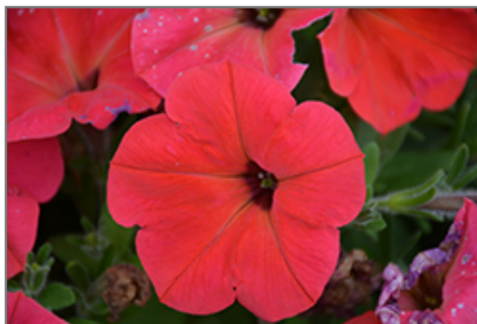
Hells Fruit Punch Petunia flowers

Hells Fruit Punch Petunia is recommended for the following landscape applications;