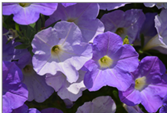
Dekko Sky Blue Petunia flowers

This plant will require occasional maintenance and upkeep. Trim off the flower heads after they fade and die to encourage more blooms late into the season. It is a good choice for attracting butterflies and hummingbirds to your yard, but is not particularly attractive to deer who tend to leave it alone in favor of tastier treats. It has no significant negative characteristics.