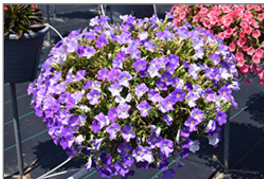
Dekko Sky Blue Petunia in bloom

Dekko Sky Blue Petunia will grow to be about 12 inches tall at maturity, with a spread of 22 inches. When grown in masses or used as a bedding plant, individual plants should be spaced approximately 18 inches apart. Its foliage tends to remain dense right to the ground, not requiring facer plants in front. This fast-growing annual will normally live for one full growing season, needing replacement the following year.