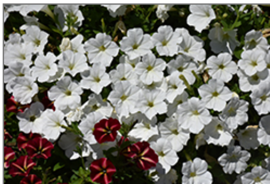
ColorRush White Petunia flowers

ColorRush White Petunia is recommended for the following landscape applications;