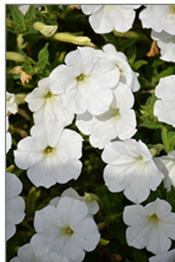
ColorRush White Petunia flowers