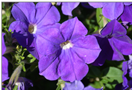
Cascadias Blue Omri Petunia flowers

Cascadias Blue Omri Petunia is recommended for the following landscape applications;