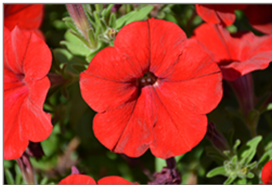
Capella Ruby Red Petunia flowers