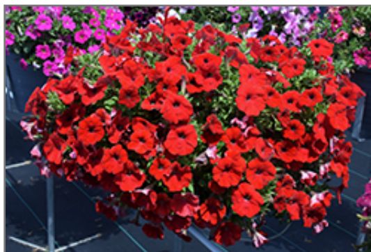
Capella Ruby Red Petunia in bloom

Capella Ruby Red Petunia will grow to be about 12 inches tall at maturity, with a spread of 16 inches. When grown in masses or used as a bedding plant, individual plants should be spaced approximately 12 inches apart. Its foliage tends to remain dense right to the ground, not requiring facer plants in front. This fast-growing annual will normally live for one full growing season, needing replacement the following year.