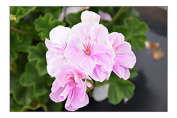
Calliope Medium Light Lavender Geranium flowers