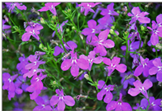
Hot Purple Lobelia flowers