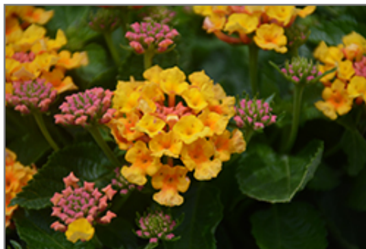
Bandana Orange Lantana flowers