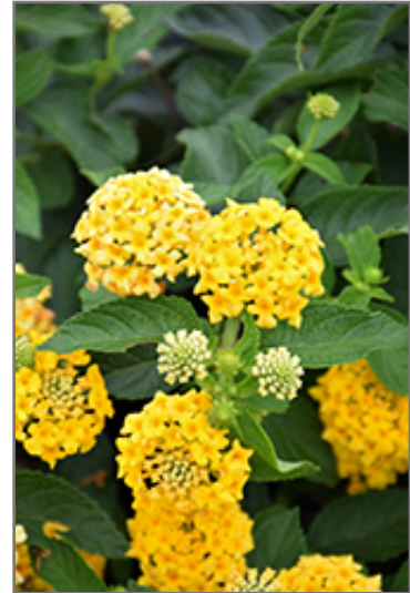
Landscape Bandana Yellow Lantana flowers

Landscape Bandana Yellow Lantana is recommended for the following landscape applications;