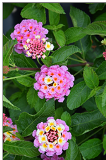
Landscape Bandana Pink Lantana flowers

Landscape Bandana Pink Lantana is recommended for the following landscape applications;