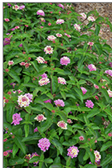
Landscape Bandana Pink Lantana in bloom