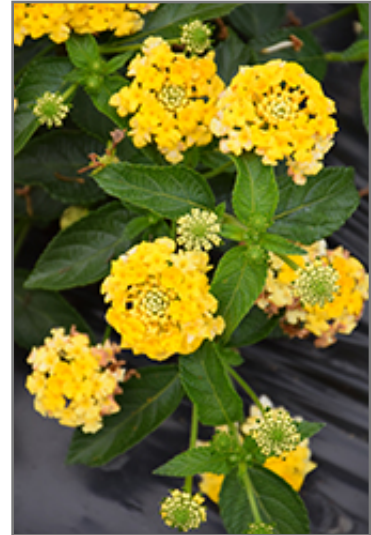
Landscape Bandana Lemon Zest Lantana flowers

Landscape Bandana Lemon Zest Lantana is a fine choice for the garden, but it is also a good selection for planting in outdoor containers and hanging baskets. Because of its spreading habit of growth, it is ideally suited for use as a 'spiller' in the 'spiller-thriller-filler' container combination; plant it near the edges where it can spill gracefully over the pot. Note that when growing plants in outdoor containers and baskets, they may require more frequent waterings than they would in the yard or garden.