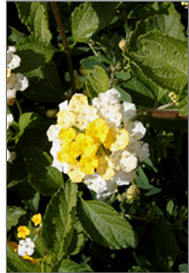
Landscape Bandana Lemon Zest Lantana flowers

Landscape Bandana Lemon Zest Lantana is recommended for the following landscape applications;