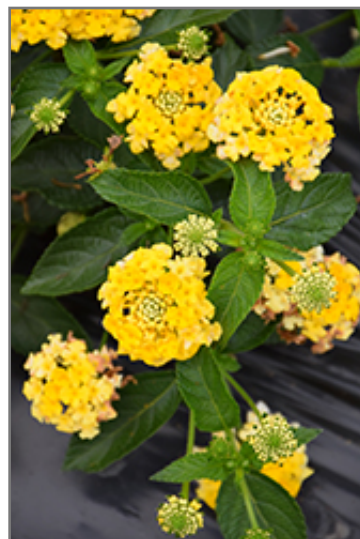
Landscape Bandana Lemon Zest Lantana flowers

Landscape Bandana Lemon Zest Lantana is a fine choice for the garden, but it is also a good selection for planting in outdoor containers and hanging baskets. Because of its spreading habit of growth, it is ideally suited for use as a 'spiller' in the 'spiller-thriller-filler' container combination; plant it near the edges where it can spill gracefully over the pot. Note that when growing plants in outdoor containers and baskets, they may require more frequent waterings than they would in the yard or garden.