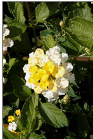
Landscape Bandana Lemon Zest Lantana flowers

Landscape Bandana Lemon Zest Lantana is recommended for the following landscape applications;