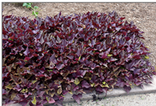
SolarPower Red Heart Sweet Potato Vine