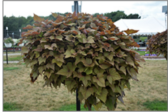
Sidekick Heart Bronze Sweet Potato Vine

Sidekick Heart Bronze Sweet Potato Vine is a fine choice for the garden, but it is also a good selection for planting in outdoor containers and hanging baskets. Because of its trailing habit of growth, it is ideally suited for use as a 'spiller' in the 'spiller-thriller-filler' container combination; plant it near the edges where it can spill gracefully over the pot. Note that when growing plants in outdoor containers and baskets, they may require more frequent waterings than they would in the yard or garden.