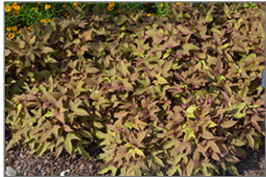
Sidekick Heart Bronze Sweet Potato Vine