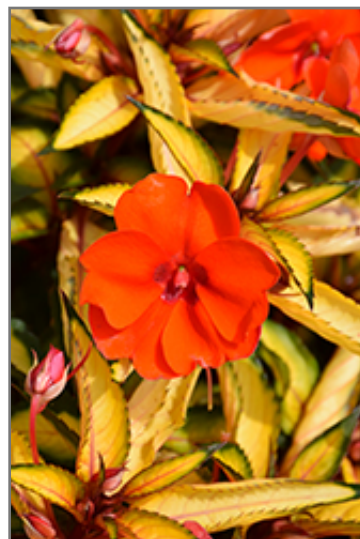
SunPatiens Vigorous Tropical Orange New Guinea Impatiens flowers

This plant will require occasional maintenance and upkeep, and should not require much pruning, except when necessary, such as to remove dieback. It has no significant negative characteristics.