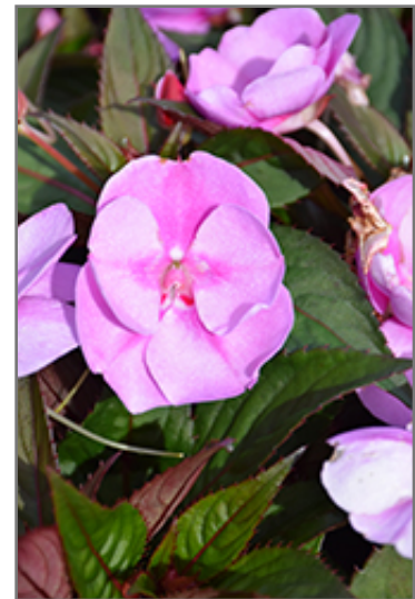
SunPatiens Vigorous Lavender Splash New Guinea Impatiens flowers