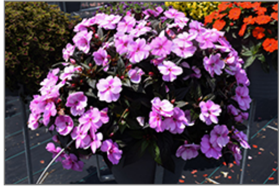
SunPatiens Vigorous Lavender Splash New Guinea Impatiens in bloom

SunPatiens Vigorous Lavender Splash New Guinea Impatiens is a fine choice for the garden, but it is also a good selection for planting in outdoor containers and hanging baskets. Because of its height, it is often used as a 'thriller' in the 'spiller-thriller-filler' container combination; plant it near the center of the pot, surrounded by smaller plants and those that spill over the edges. It is even sizeable enough that it can be grown alone in a suitable container. Note that when growing plants in outdoor containers and baskets, they may require more frequent waterings than they would in the yard or garden.