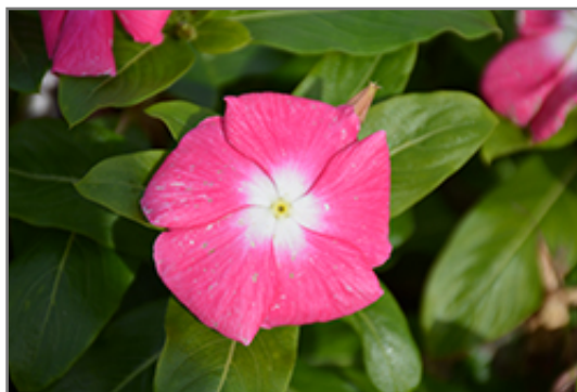
Cora XDR Pink Halo flowers

Cora XDR Pink Halo is recommended for the following landscape applications;