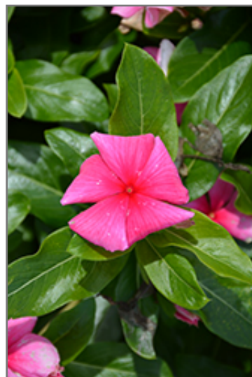
Cora XDR Deep Strawberry flowers

Cora XDR Deep Strawberry is recommended for the following landscape applications;