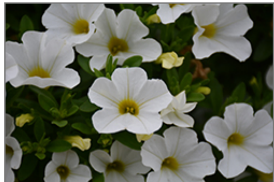
MiniFamous Uno White Calibrachoa flowers