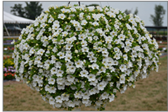
MiniFamous Uno White Calibrachoa in bloom

MiniFamous Uno White Calibrachoa is a fine choice for the garden, but it is also a good selection for planting in outdoor containers and hanging baskets. Because of its trailing habit of growth, it is ideally suited for use as a 'spiller' in the 'spiller-thriller-filler' container combination; plant it near the edges where it can spill gracefully over the pot. Note that when growing plants in outdoor containers and baskets, they may require more frequent waterings than they would in the yard or garden.