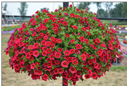
Lia Raspberry Calibrachoa in bloom