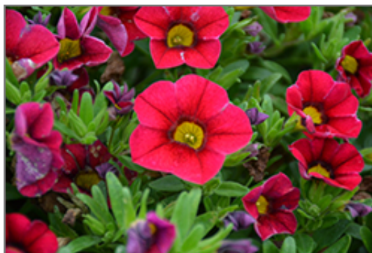
Lia Raspberry Calibrachoa flowers

Lia Raspberry Calibrachoa is a dense herbaceous annual with a trailing habit of growth, eventually spilling over the edges of hanging baskets and containers. Its medium texture blends into the garden, but can always be balanced by a couple of finer or coarser plants for an effective composition.