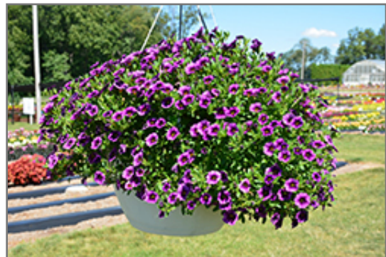
Colibri Purple Lace Calibrachoa in bloom