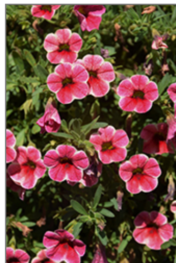
Colibri Cherry Lace Calibrachoa flowers