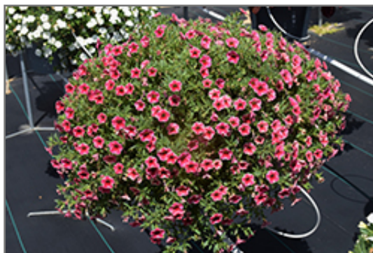
Colibri Cherry Lace Calibrachoa in bloom

Colibri Cherry Lace Calibrachoa is a fine choice for the garden, but it is also a good selection for planting in outdoor containers and hanging baskets. It is often used as a 'filler' in the 'spiller-thriller-filler' container combination, providing a mass of flowers against which the thriller plants stand out. Note that when growing plants in outdoor containers and baskets, they may require more frequent waterings than they would in the yard or garden.