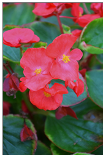
Volumia Scarlet Begonia flowers

Volumia Scarlet Begonia is recommended for the following landscape applications;