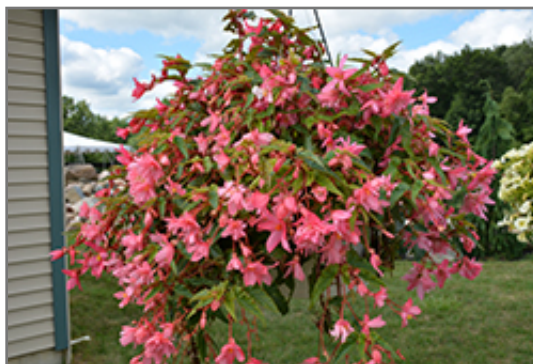
Funky Light Pink Begonia in bloom

Funky Light Pink Begonia is a fine choice for the garden, but it is also a good selection for planting in outdoor containers and hanging baskets. It is often used as a 'filler' in the 'spiller-thriller-filler' container combination, providing a mass of flowers and foliage against which the thriller plants stand out. Note that when growing plants in outdoor containers and baskets, they may require more frequent waterings than they would in the yard or garden.