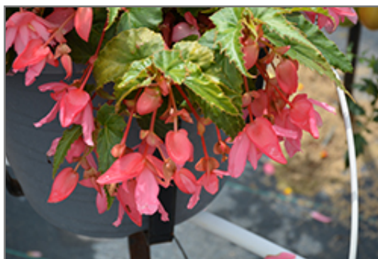
Funky Light Pink Begonia flowers