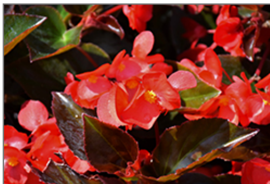
Big DeLuXXE Red Bronze Leaf Begonia flowers