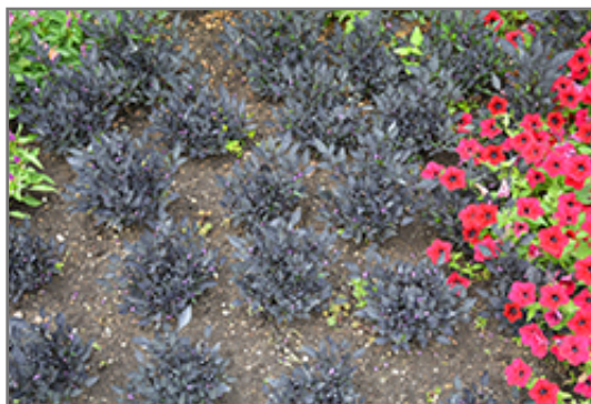
Onyx Red Ornamental Pepper

This plant will require occasional maintenance and upkeep, and should not require much pruning, except when necessary, such as to remove dieback. It is a good choice for attracting bees and butterflies to your yard, but is not particularly attractive to deer who tend to leave it alone in favor of tastier treats. It has no significant negative characteristics.