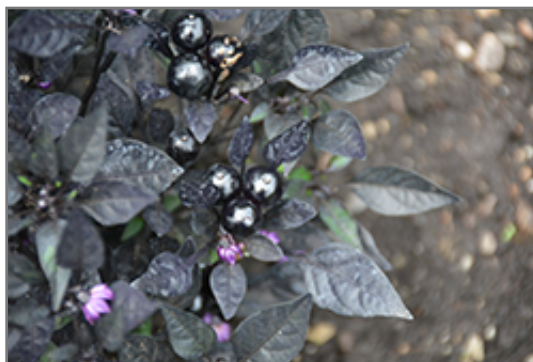
Onyx Red Ornamental Pepper fruit