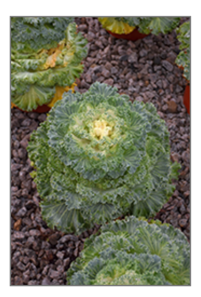
Kamome White Kale