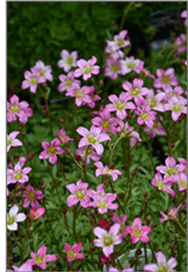
Touran Pink Saxifrage flowers

Touran Pink Saxifrage is recommended for the following landscape applications;