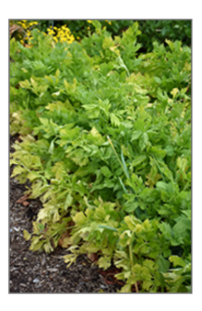
Golden Self-Blanching Celery

This plant is typically grown in a designated vegetable garden. It does best in full sun to partial shade. It prefers to grow in average to moist conditions, and shouldn't be allowed to dry out. It may require supplemental watering during periods of drought or extended heat. It is not particular as to soil pH, but grows best in rich soils. It is quite intolerant of urban pollution, therefore inner city or urban streetside plantings are best avoided. This is a selected variety of a species not originally from North America.