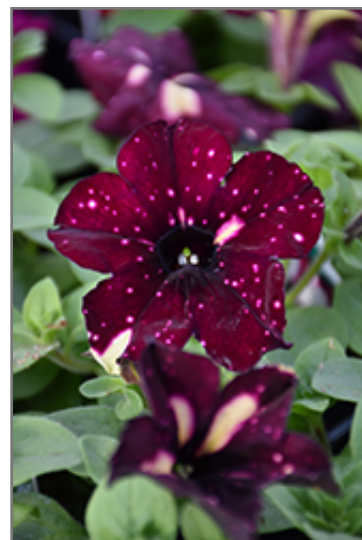
Headliner Starry Sky Burgundy Petunia flowers