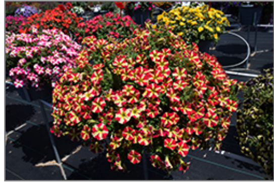
Amore Queen of Hearts Petunia in bloom

Amore Queen of Hearts Petunia will grow to be about 12 inches tall at maturity, with a spread of 14 inches. When grown in masses or used as a bedding plant, individual plants should be spaced approximately 10 inches apart. Its foliage tends to remain dense right to the ground, not requiring facer plants in front. This fast-growing annual will normally live for one full growing season, needing replacement the following year.