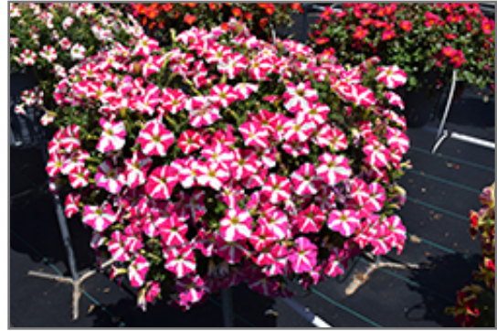
Amore Pink Heart Petunia in bloom

Amore Pink Heart Petunia will grow to be about 12 inches tall at maturity, with a spread of 14 inches. When grown in masses or used as a bedding plant, individual plants should be spaced approximately 10 inches apart. Its foliage tends to remain dense right to the ground, not requiring facer plants in front. This fast-growing annual will normally live for one full growing season, needing replacement the following year.