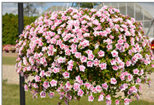
MiniFamous Uno Double PinkTastic Calibrachoa in bloom