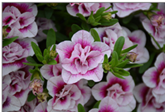
MiniFamous Uno Double PinkTastic Calibrachoa flowers

MiniFamous Uno Double PinkTastic Calibrachoa is a dense herbaceous annual with a trailing habit of growth, eventually spilling over the edges of hanging baskets and containers. Its medium texture blends into the garden, but can always be balanced by a couple of finer or coarser plants for an effective composition.