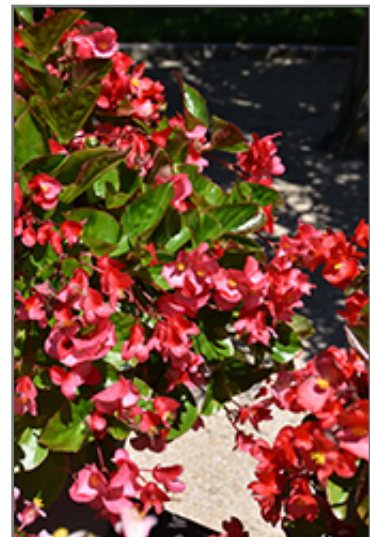
Viking XL Rose on Green Begonia flowers