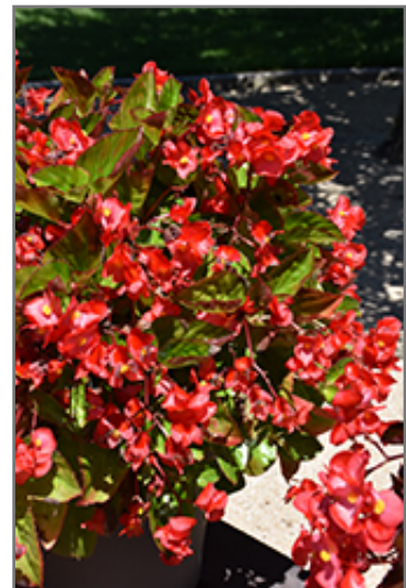
Viking XL Red on Green Begonia flowers