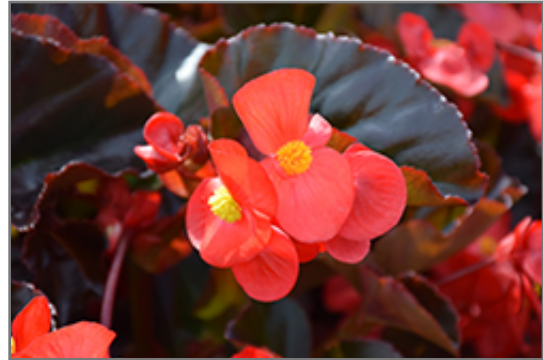
Viking XL Red on Chocolate Begonia flowers

Viking XL Red on Chocolate Begonia is recommended for the following landscape applications;