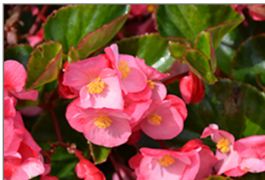
Viking Pink on Green Begonia flowers

Viking Pink on Green Begonia is recommended for the following landscape applications;