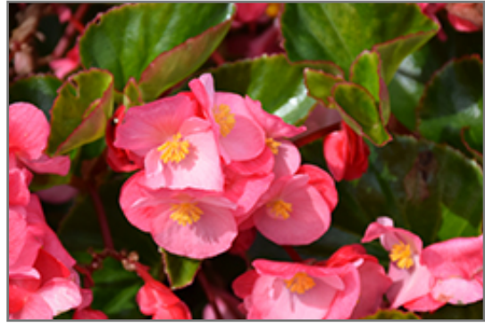
Viking Pink on Green Begonia flowers

Viking Pink on Green Begonia is recommended for the following landscape applications;