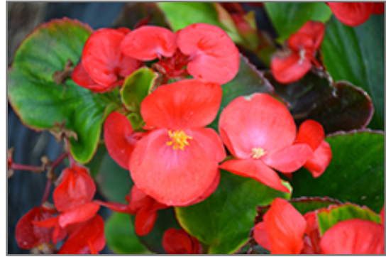
Topspin Scarlet Begonia flowers

Topspin Scarlet Begonia is recommended for the following landscape applications;