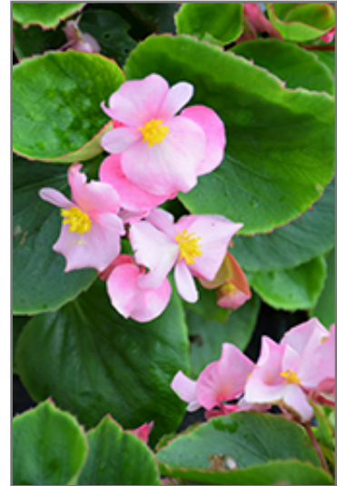
Topspin Pink Begonia flowers

Topspin Pink Begonia is recommended for the following landscape applications;