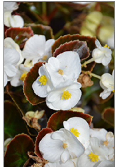
Senator IQ White flowers