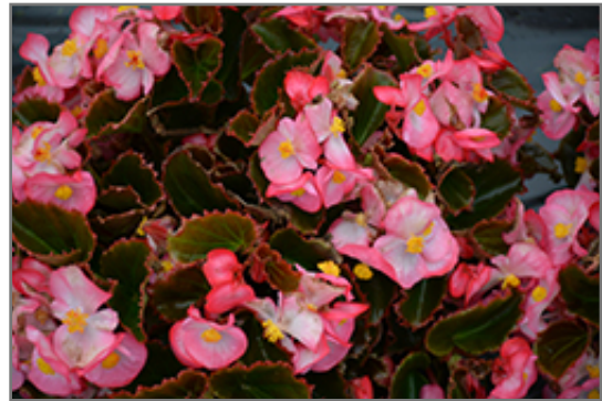
Senator IQ Rose Bicolor flowers