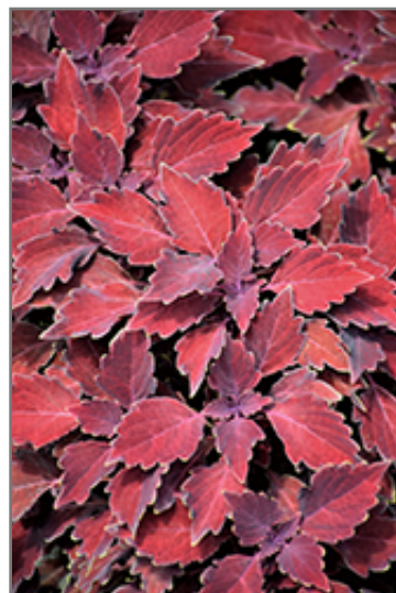
ColorBlaze Royale Cherry Brandy Coleus foliage

ColorBlaze Royale Cherry Brandy Coleus is recommended for the following landscape applications;