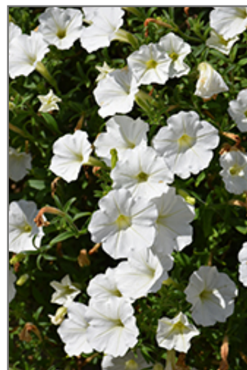
Supertunia Vista Snowdrift Petunia flowers