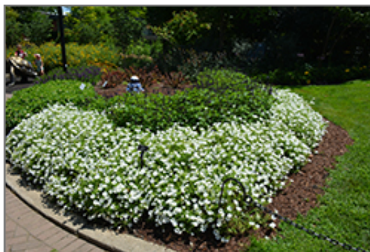
Supertunia Vista Snowdrift Petunia in bloom

Supertunia Vista Snowdrift Petunia is a fine choice for the garden, but it is also a good selection for planting in outdoor containers and hanging baskets. Because of its trailing habit of growth, it is ideally suited for use as a 'spiller' in the 'spiller-thriller-filler' container combination; plant it near the edges where it can spill gracefully over the pot. It is even sizeable enough that it can be grown alone in a suitable container. Note that when growing plants in outdoor containers and baskets, they may require more frequent waterings than they would in the yard or garden.