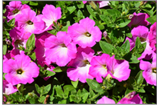
Opera Supreme Pink Morn Petunia flowers

This plant will require occasional maintenance and upkeep. Trim off the flower heads after they fade and die to encourage more blooms late into the season. It is a good choice for attracting butterflies and hummingbirds to your yard, but is not particularly attractive to deer who tend to leave it alone in favor of tastier treats. It has no significant negative characteristics.