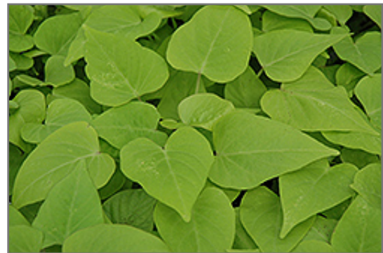
Sweet Caroline Sweetheart Light Green Sweet Potato Vine foliage