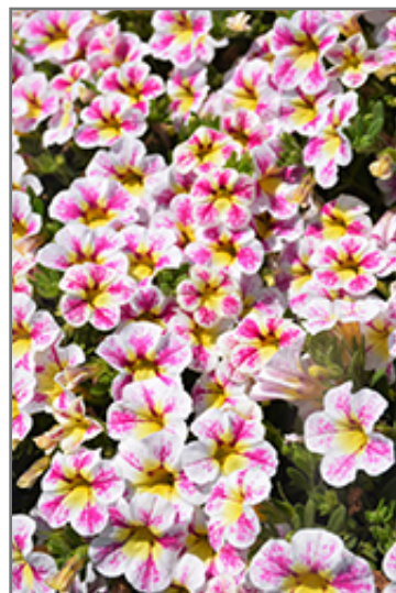
Superbells Holy Cow! Calibrachoa flowers

Superbells Holy Cow! Calibrachoa is a dense herbaceous annual with a trailing habit of growth, eventually spilling over the edges of hanging baskets and containers. Its medium texture blends into the garden, but can always be balanced by a couple of finer or coarser plants for an effective composition.