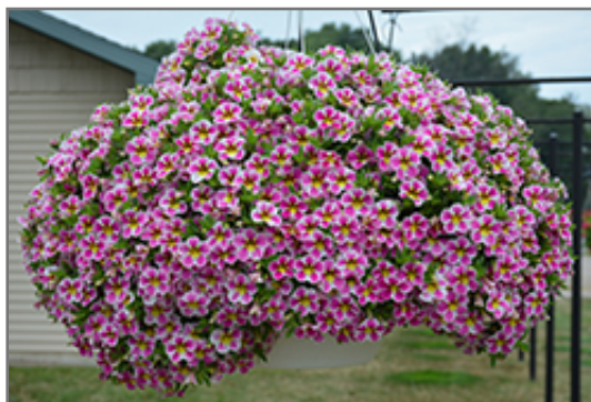
Superbells Holy Cow! Calibrachoa in bloom