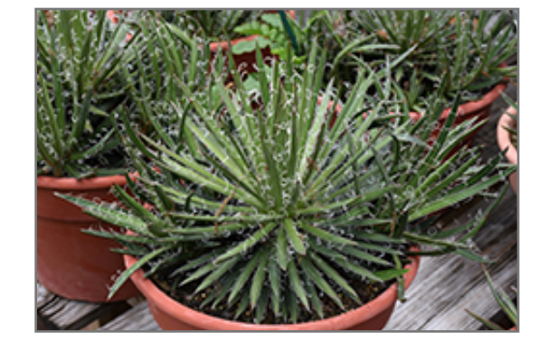
Leopold Agave