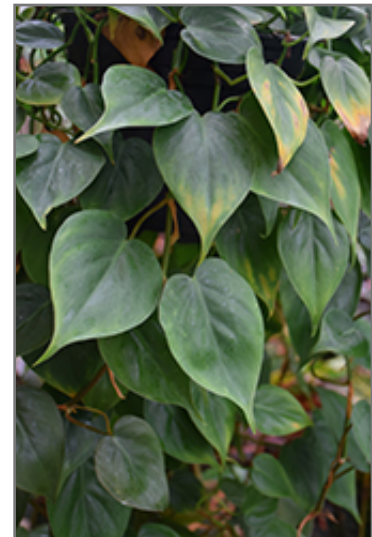
Jade Pothos foliage